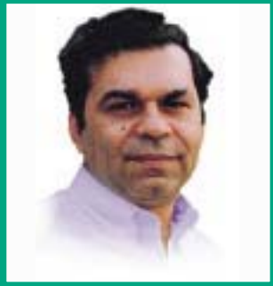
Dr Eliyahu M Goldratt

DR ELI GOLDRATT author of 'The Goal' and Critical Chain'